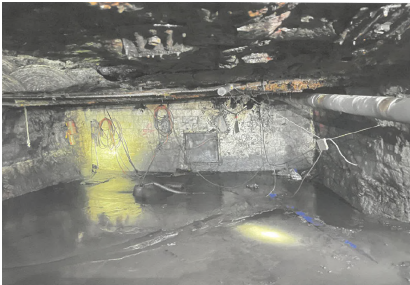
Area view of the location where Mr. Finley was found. (Photo taken Saturday, August 19, 2023, at 2:16 a.m.)