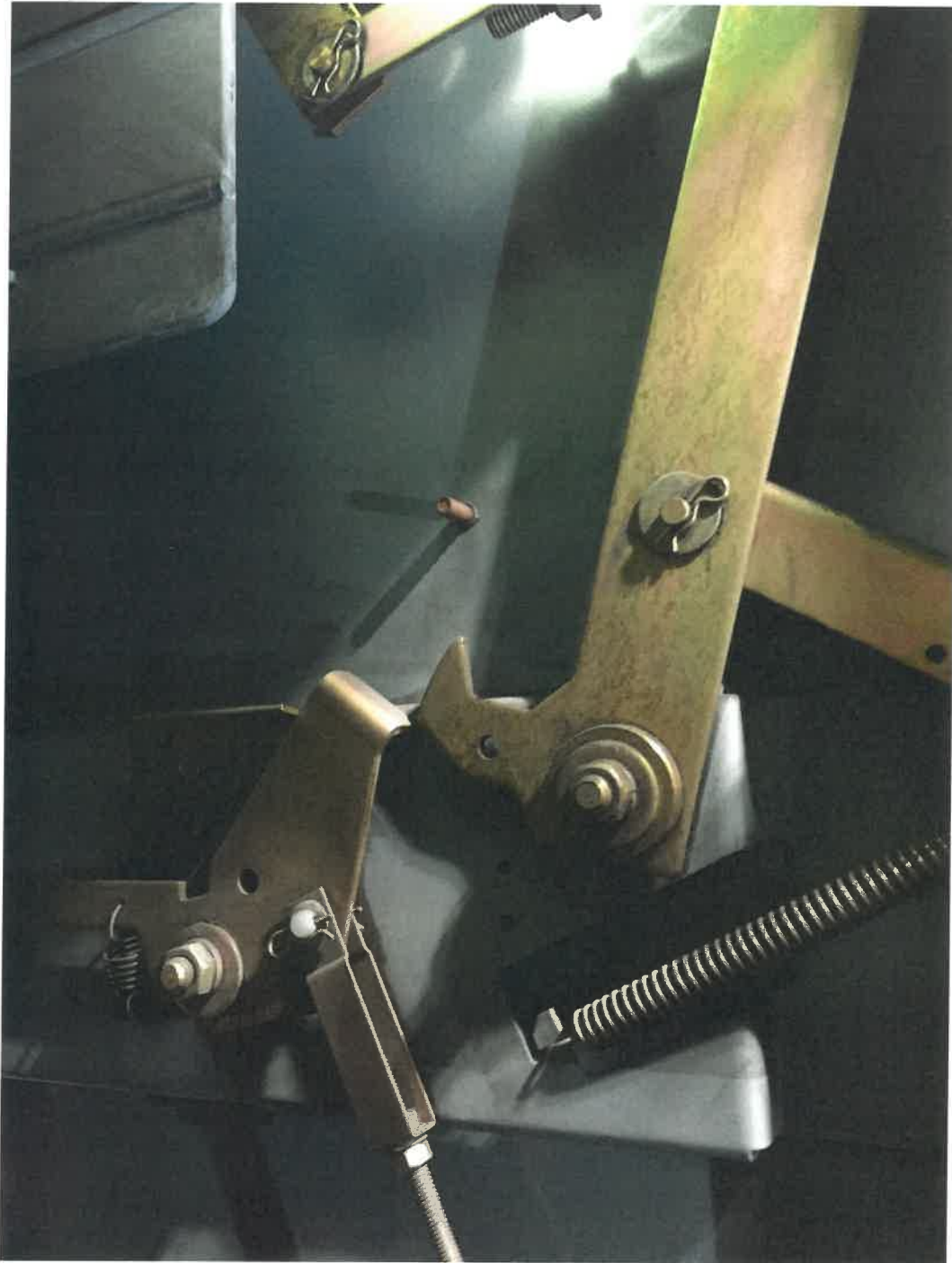
Photo 1.3 Side view of disconnect linkage in slope belt A drive cabinet.