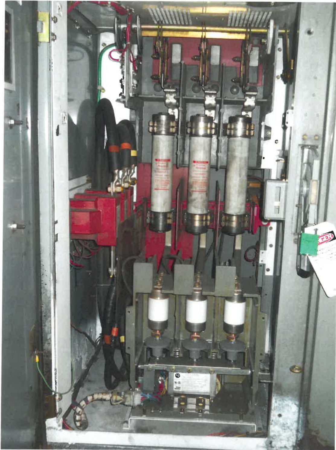
Photo 1.2 Inside of the slope belt A drive cabinet