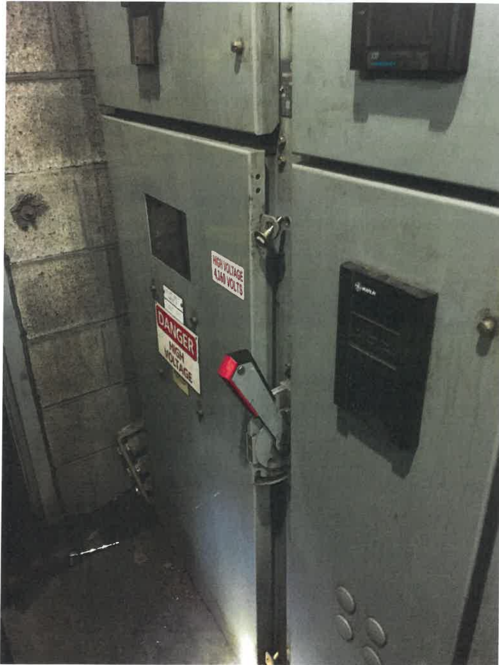
Photo 1.1 Outside of slope belt A drive cabinet

*Note- Disconnect handle was found to be in the closed position.